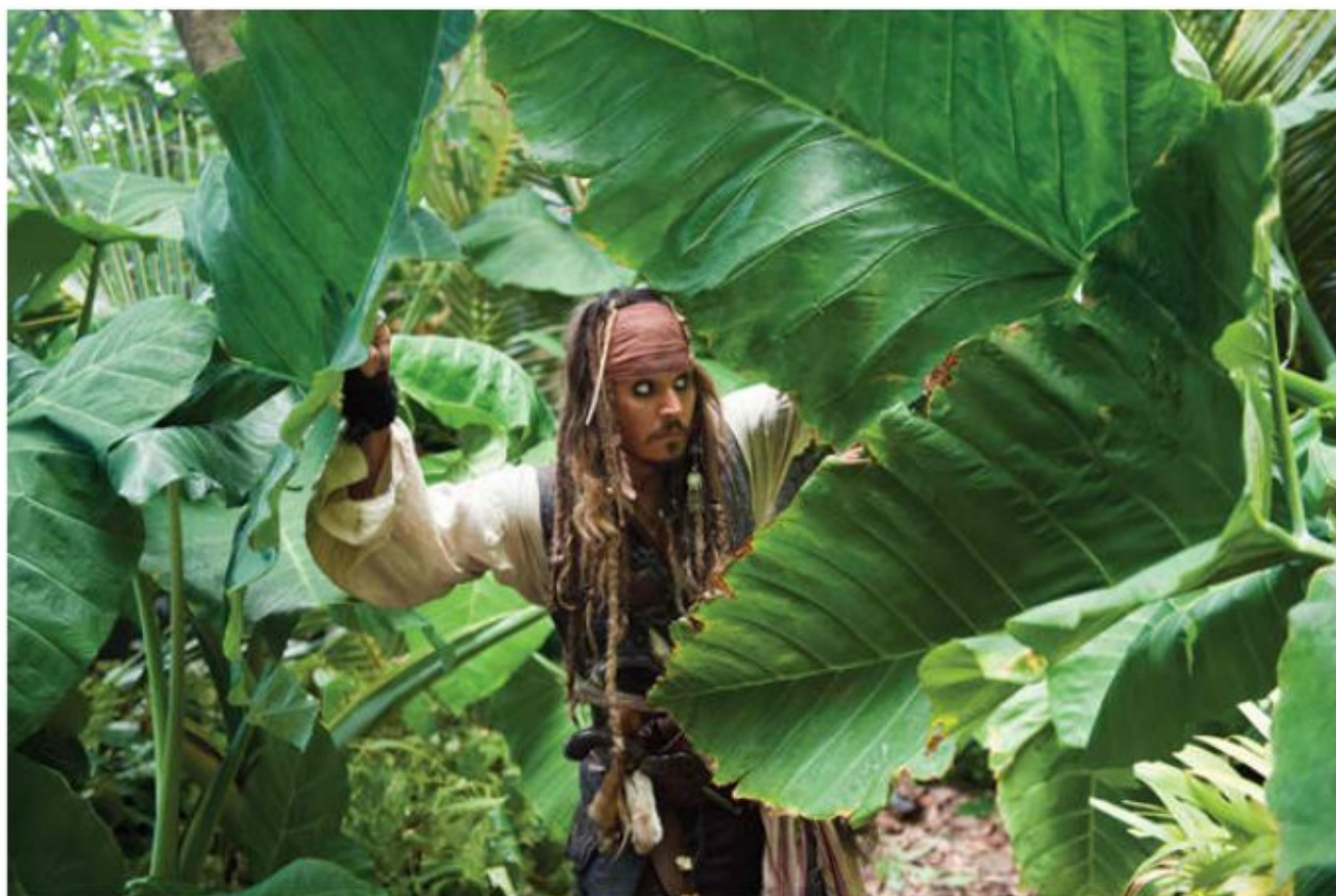
"PIRATES OF THE CARIBBEAN: ON STRANGER TIDES" Johnny Depp