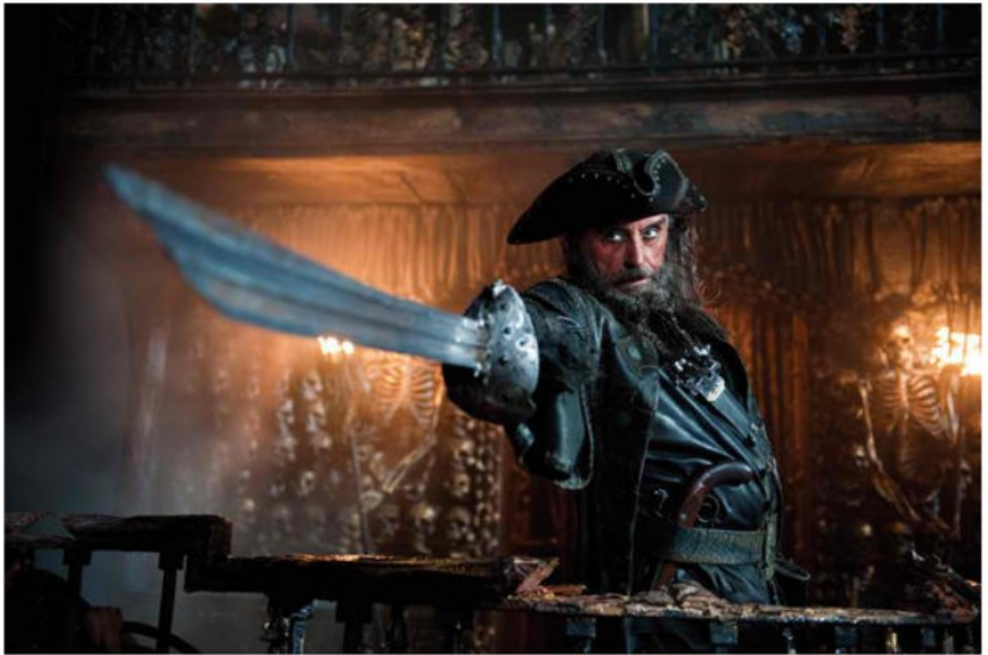
"PIRATES OF THE CARIBBEAN: ON STRANGER TIDES" Blackbeard (Ian McShane)