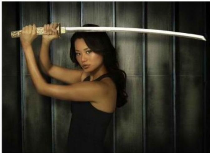
Jamie Chung as Samurai Girl...

And last but not least I want to show you my inspiration for a photoshoot i did recently