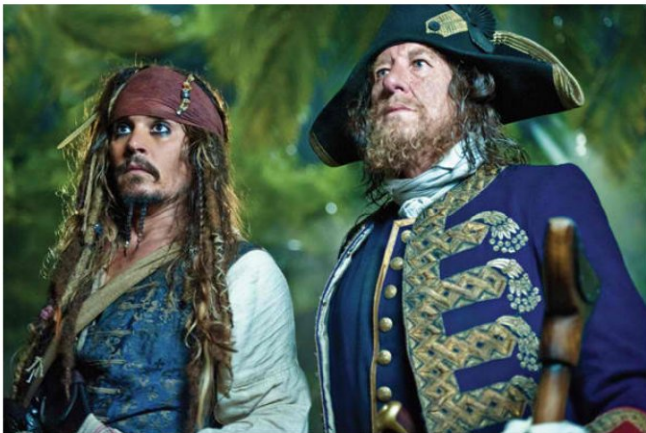
"PIRATES OF THE CARIBBEAN: ON STRANGER TIDES" Captain Jack Sparrow (JOHNNY DEPP) and his old nemesis Captain Barbossa (GEOFFREY RUSH) are thrown together by fate in the search for the Fountain of Youth.